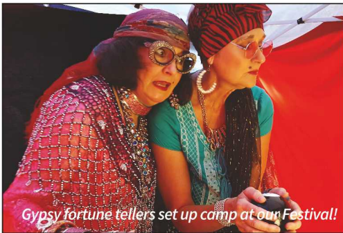
Gypsy fortune tellers set up camp at our Festival!