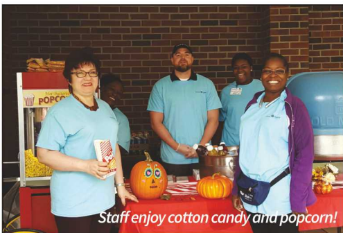
Staff enjoy cotton candy and popcorn!